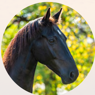
In the show: Liberty – Equipe Bartolo Messina

Friesian horses, also known as the “black pearls of Friesland”, have a long-standing history. They were first mentioned in the times of Ancient Rome and have since evolved into a popular European breed. The distinctive type known today emerged in the 16th century, when they were crossbred with Iberian horses. The fascination with the Friesian horse is in part owed to its beautiful, mystical appearance straight from a fairy tale with its long, lush mane and its similarly striking feathering. Thanks to its Spanish heritage, this breed, which was often used for work on the fields, performs bold and expressive gaits, which makes it predestined for dressage. Whether for classical or circensic dressage, these intelligent and sensitive black giants are all-round talents and often used as show acts because of their impressive appearance. Of course, CAVALLUNA is thrilled to have these Dutch show stars perform in the arena, because there aren’t many horses this majestic!