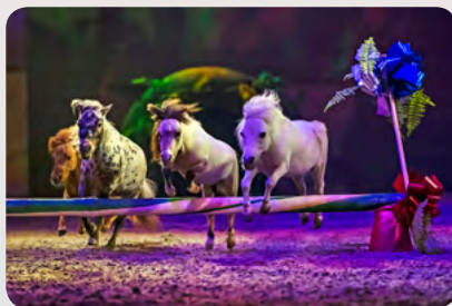
Mini ponys by Bartolo Messina