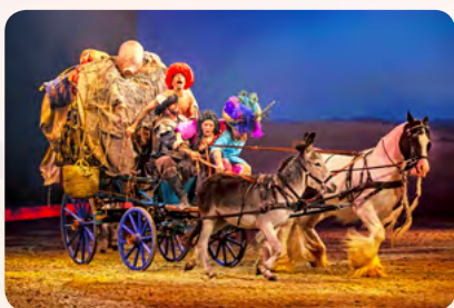
Comedy with donkey and tinkers

The following press pictures are available for download. The preview images link to the photos in high resolution. You also find the photos here: https://www.cavalluna.com/en/press-portal/legend-of-the-desert Copyright: CAVALLUNA // Resoution: 300 dpi