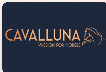
CAVALLUNA logo as PNG