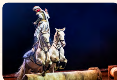
Hungarian Post