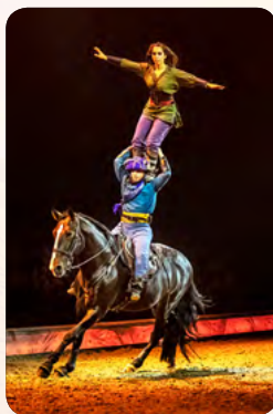
Trickrider of Hasta Luego Academy