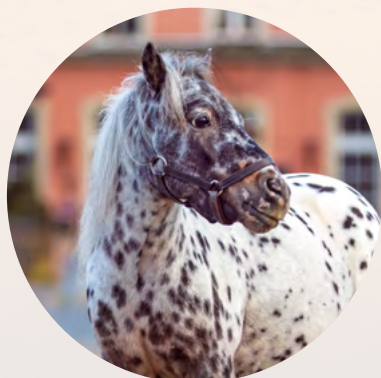
In the Show: Liberty with Mini ponys – Equipe Bartolo Messina

Lusitano horses are close relatives of the Andalusian horse. However, the breeding business in Portugal developed very differently than in Spain and their independent stud book was not introduced until 1942. Due to its compact and brawny build, the Iberian horse breed is perfectly suited for dressage, even the classical discipline. The Lusitano's expressive, noble head with its big eyes is set on an optimally curved neck that emerges from muscular shoulders. Lusitano horses are characterised by their courage, their great strength of nerve and their reliability. They are very eager to work and fast learners. Their brisk temper is easily balanced out by their sensitive nature. More than other horse breeds, the Lusitano is quick to bond with humans and has a close relationship with its owner – a lifelong friendship. The horses' temper and willingness to learn make them predestined for various tasks, for example cattle herding.