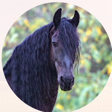
In the show: Dressage – Equipe Filipe Fernandes