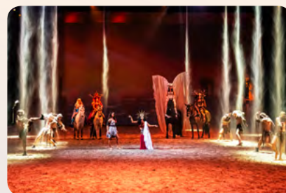
The four Amazons