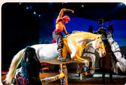
Trickrider of Hasta Luego Academy