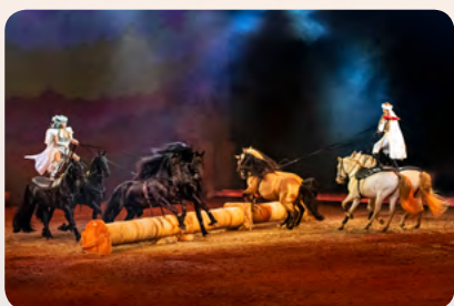
Pas de deux by equipe Gionia