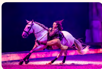
Trickrider of Hasta Luego Academy