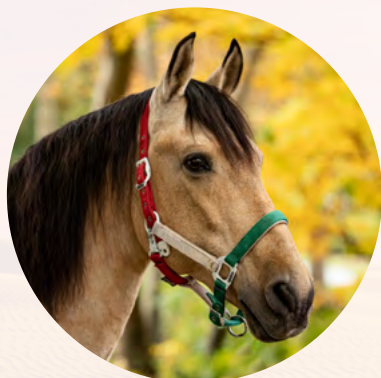
In the show: Trickreiding – Hasta Luego Academy