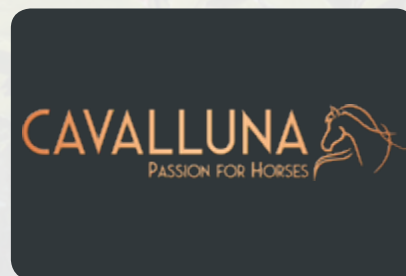
CAVALLUNA logo as PNG