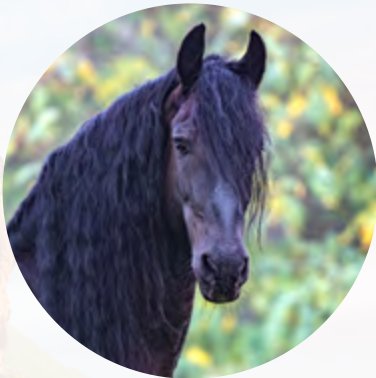
In the show: Dressage – Equipe Filipe Fernandes