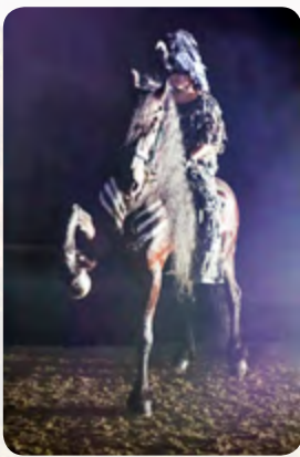
Spanish step of the Equipe Fernandes

The following pre-press pictures are available for download. The preview images link to the photos in high resolution. You also find the photos HERE . Resolution: 300 dpi