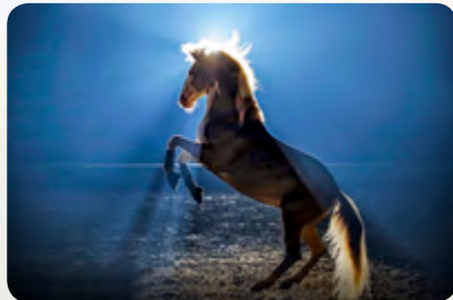
Rising Lusitano stallion