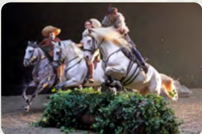
Trickrider Sasá Importa in jumping