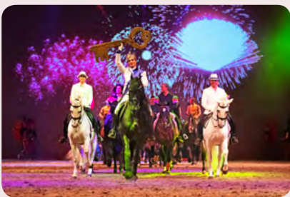
Show final of "CELEBRATION!"