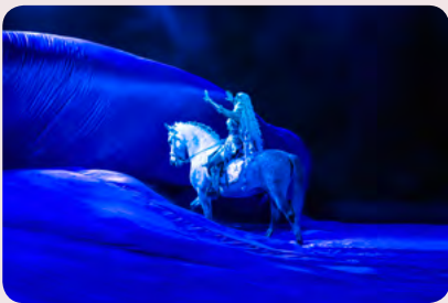
Dajana Pfeifer as the Amazon of Water

The following press images are available for download (thumbnails are linked to the high-resolution material). You can find all press material for download here . (resolution: 300 dpi).