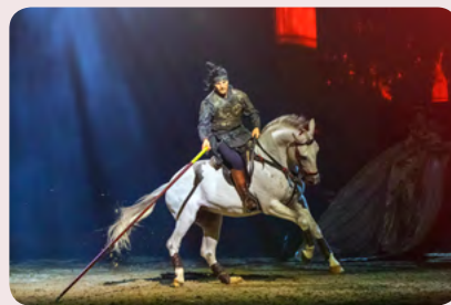
Garrocha