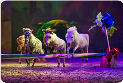
Bartolo Messina's miniature ponies