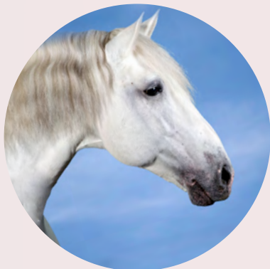
In the show: Classical Dressage – Equipe Valença