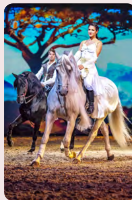
Pas de Deux of equipe Fernández