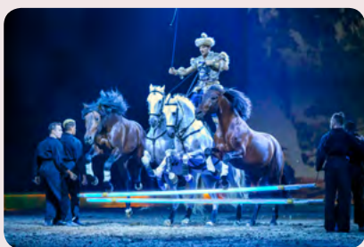
Hungarian Post by Laury Tisseur

The following press images are available for download (thumbnails are linked to the high-resolution material). You can find all press material for download here . (resolution: 300 dpi)