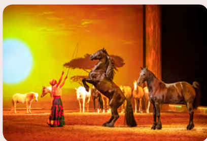
Liberty dressage by Sylvie Willms