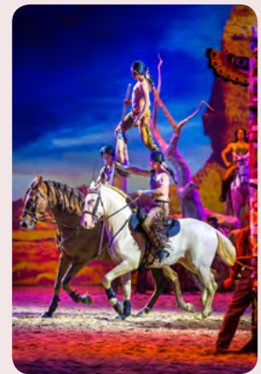
Pyramid of Hasta Luego Academy