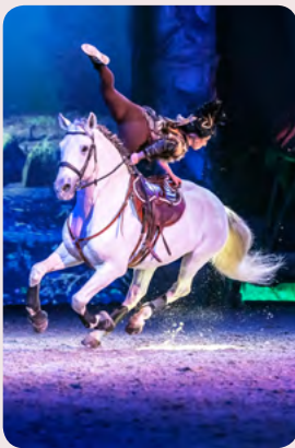
Trickrider of Hasta Luego Academy

The following press images are available for download (thumbnails are linked to the high-resolution material). You can find all press material for download here . (Copyright: CAVALLUNA // resolution: 300 dpi).